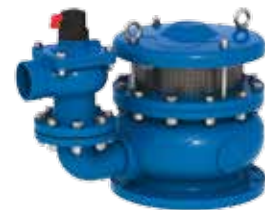
VB-060 + D-070

Please see the table below for all the additional air valve options available.