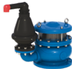
VB-060 + D-025

Please see the table below for all the additional air valve options available.