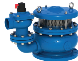
VB-060 + D-070

Please see the table below for all the additional air valve options available.